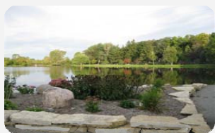
Harris Mill Park