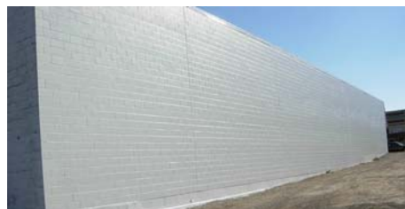
Freshly painted west wall of Jud-Sons Bowling Alley