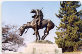
"End of the Trail"

Community News is an E-newsletter capturing key events of the City of Waupun, and the various departments within the City. The newsletter will largely focus on 10 goals identified during the June 2010 strategic planning session: 1) To Create Pool Facility in Fond du Lac County Park/McCune Beach; 2) Bike Trail – Connect Wild Goose Trail to the City (East & West Sides); 3) Consolidate Recreational Area (Sports Complex); 4) Facilitate Construction of Banquet Hall; 5) Fill the Pamida Building; 6) Streamline Process for Recruiting New Businesses; 7) Bring in Large Business/Industry; 8) 400 Block of East Main Street; 9) Promote Waupun as Excellent Community for Business & Family; 10) Work on Main Street (Empty Buildings).