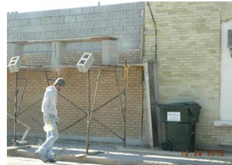
Addition (for walk in cooler) to south side of 435 E. Main