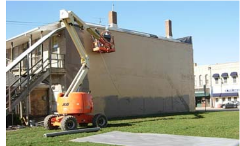
Painting is underway at 409 E. Main!