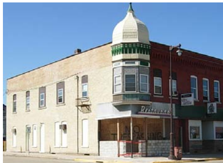
Progress photo of remodeled front entrance of 435 E. Main (former Corner Restaurant)