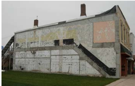
Before picture of east wall of 409 E. Main (former Fox Computer building)

to help meet this goal of improving the aesthetics of downtown Waupun. Take a look at some of the progress – and watch for more to come!