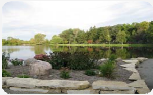
Harris Mill Park