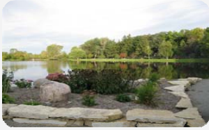
Harris Mill Park