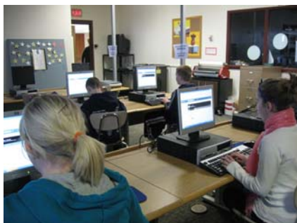
Waupun 6 th graders are having an online discussion about bullying on My Big Campus.