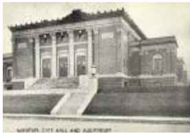
Early Picture of Waupun City Hall

Stop by the Waupun Historical Society's website! http://waupun.pastperfect-online.com