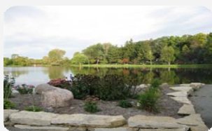
Harris Mill Park