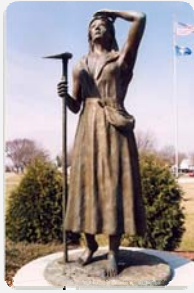
"Who Sows Believes In God"

Stop by the Waupun Historical Society's website!