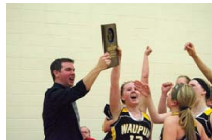
Girls Basketball – Regional Champs!

Check out the "Booster Shout Outs" for Girls Basketball, Gymnastics, and Hockey following the newsletter!