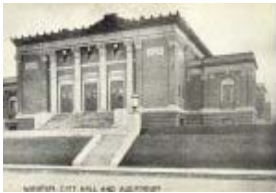
Early Picture of Waupun City Hall