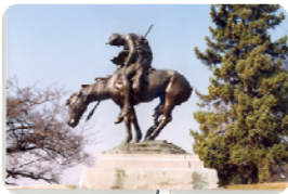
"End of the Trail"