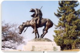
"End of the Trail"

Community News is an E-newsletter capturing key events of the City of Waupun, and the various departments within the City. You can also find helpful information from the local schools, the Booster Club, Waupun Area Chamber of Commerce, and local service organizations and non-profits in special sections of Community News .