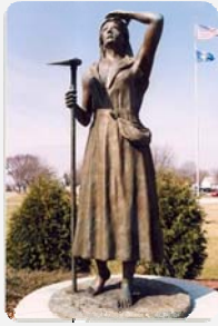
"Who Sows Believes In God"