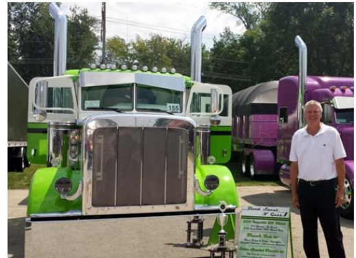
This 2013 Peterbilt 389 Glider named "Blood, Sweat, 'N' Gass" was awarded Mayor's Choice for Best of Show.