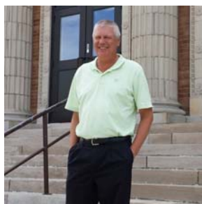
Getting ready to take the Challenge.