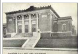
Early picture of City Hall