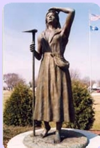
"Who Sows Believes In God"