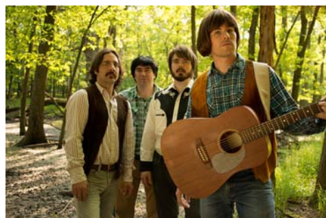
The Fortunate Sons

offering cowboy music and comedy on Friday, October 9th . Riders are the ONLY exclusively Western artist to have won a Grammy, and they have won two! Riders performed "Woody's