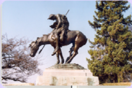
"End of the Trail"