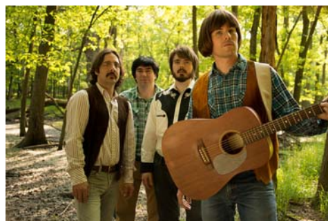
The Fortunate Sons

offering cowboy music and comedy on Friday, October 9th . Riders are the ONLY exclusively Western artist to have won a Grammy, and they have won two! Riders performed "Woody's