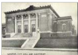
Early picture of City Hall