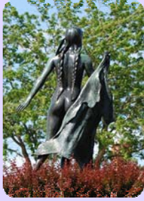
"Dawn of Day"

Waupun Area Animal Shelter's "A Day Gone to the Dogs"