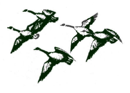
"Wild Goose Center of Wisconsin"